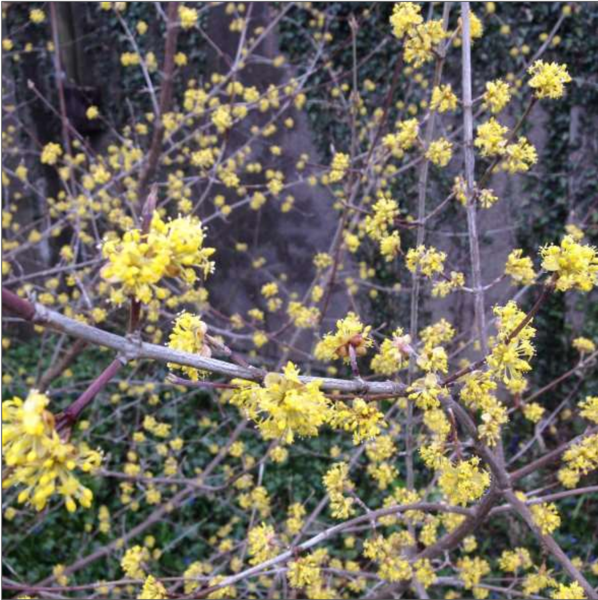
Cornelian Cherry Dogwood